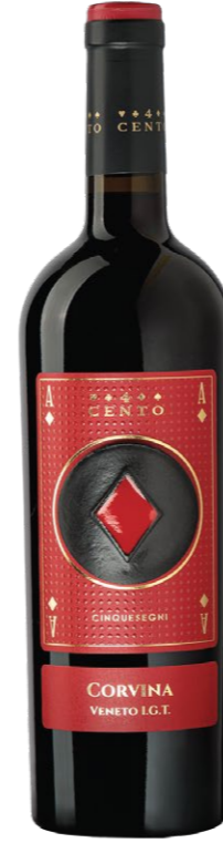
Corvina IGT Veneto