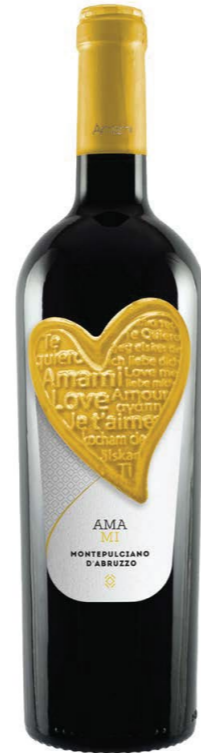
Montepulciano d'Abruzzo DOC