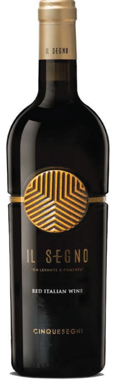
Five grapes blend