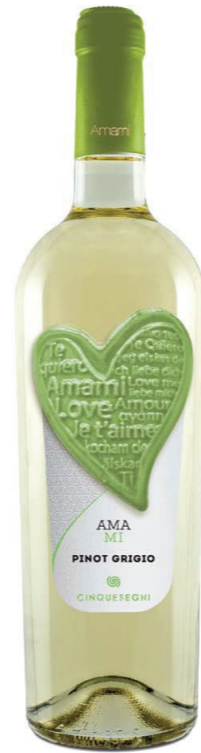
Pinot Grigio IGT Terre Siciliane