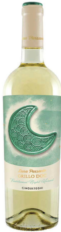
Grillo DOC Sicilia