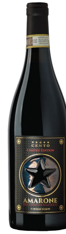
Amarone della Valpolicella DOCG