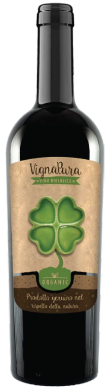
Vino Rosso Organico