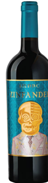
Zinfandel IGP Puglia