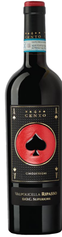
Valpolicella Ripasso DOC Superiore