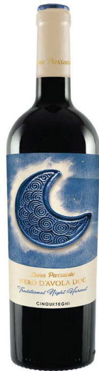
Nero d'Avola DOC Sicilia