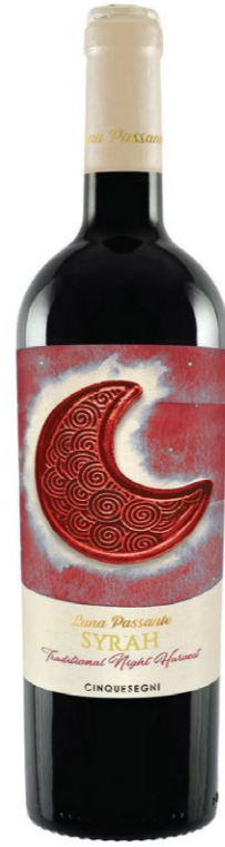
Syrah IGT Terre Siciliane