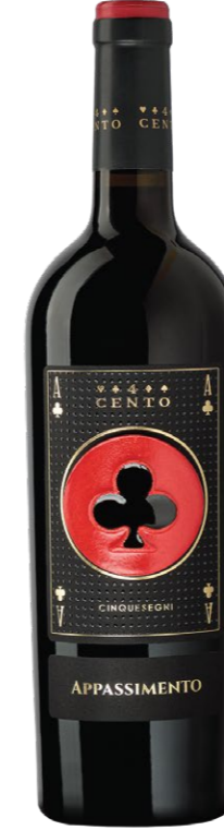
Appassimento Rosso IGT Veneto